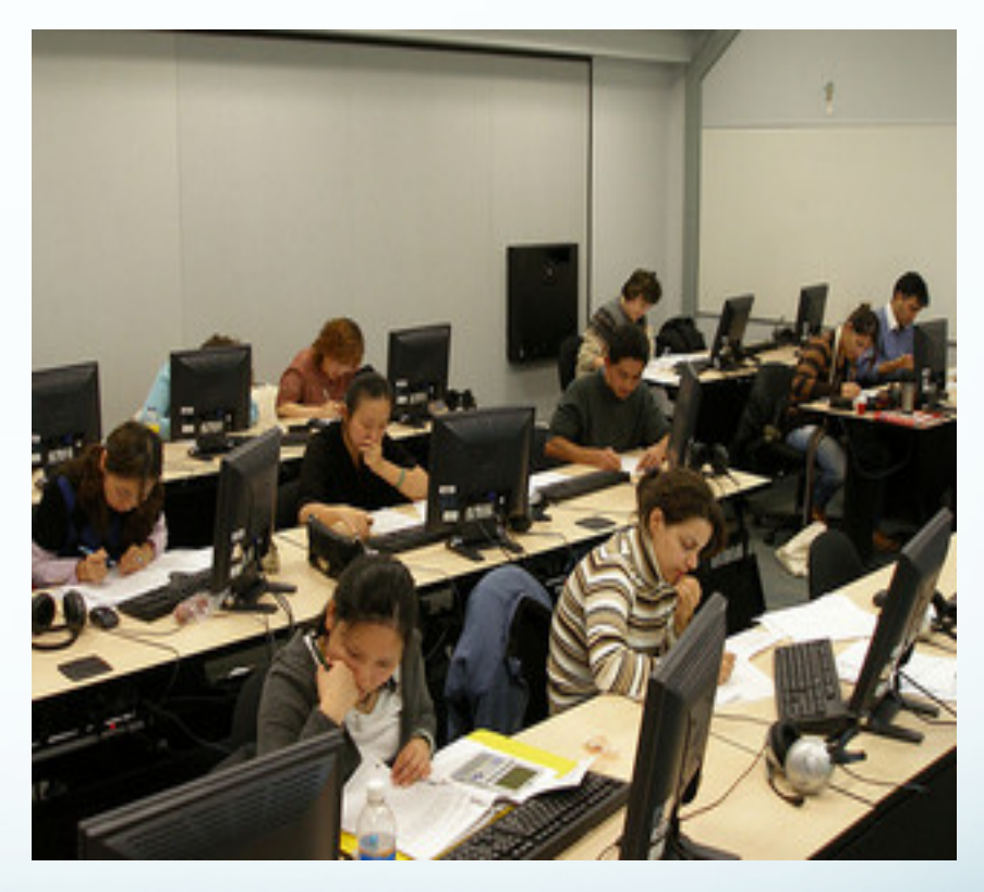
Teacher Focus Groups