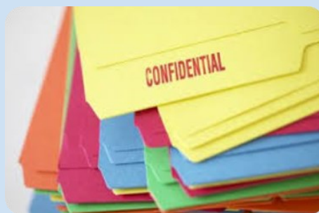
Confidential, secure, and all