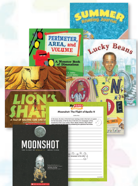
Grade 3 STEM Pack Pictured

Please refer to the order form on the following page for additional details on these summer solutions. For more information on these resources and our other comprehensive solutions, or to make an appointment to discuss the unique needs of your students, please contact: