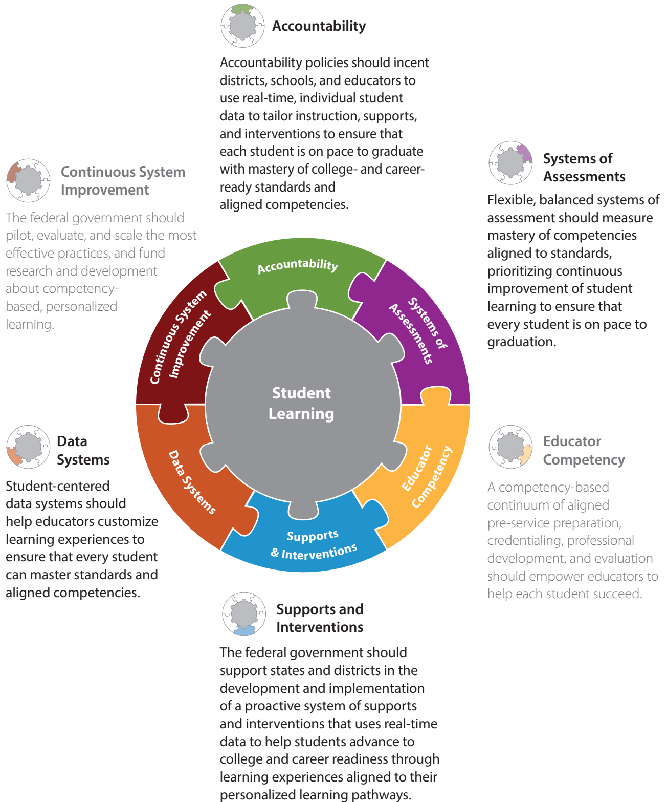
FIGURE 2: Enabling Policy Framework for Competency Education