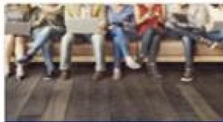
Suicide Prevention (Adi's Act)