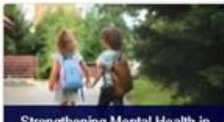
Strengthening Mental Health in Education