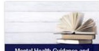
Mental Health Guidance and Resources