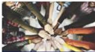
Mental Health Toolkit