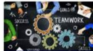
Model for Mental Health