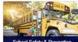
School Safety & Prevention System (SSPS)