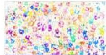
All Students Belong